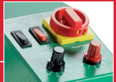
The well arranged operating unit offers simple control of the relevant welding parameters speed and temperature.