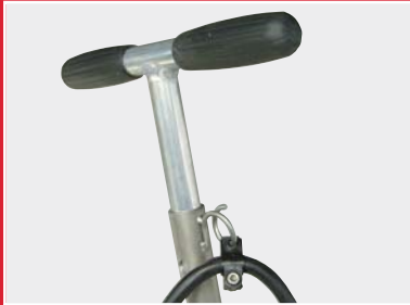
Ergonomic, back-protecting guide bar.

The power pack for fast and economic welding of tarpaulin bows for lorries. With its top speed of up to 20 m/min it is the fastest tarpaulin bow welding machine in the world. The TAPEMAT «Spiegel», an investment, which already pays off after shortest time!