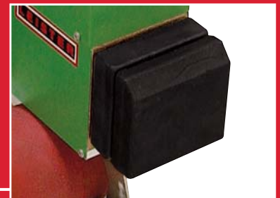
Extra weights for more pressure and a perfect welding quality.