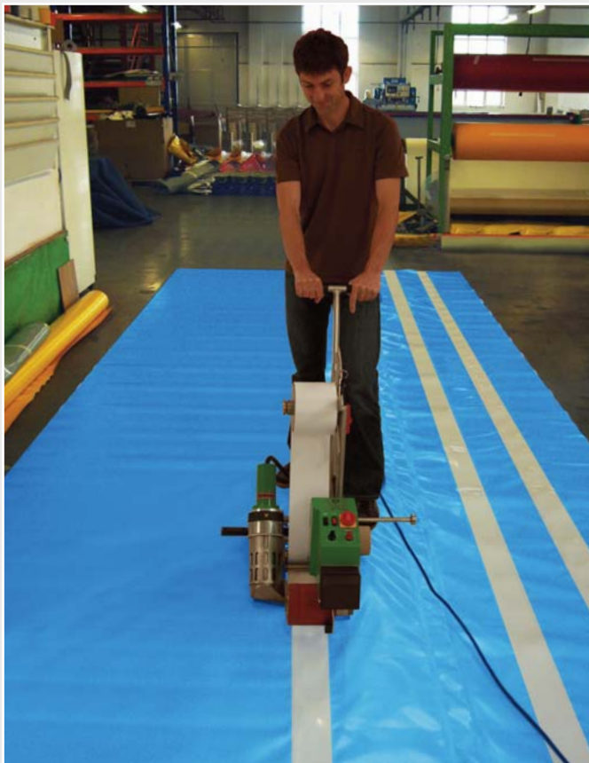
Intuitive operation and simple handling