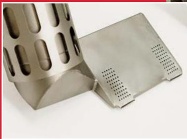
The sturdy hot air nozzle guarantees perfect welding quality.