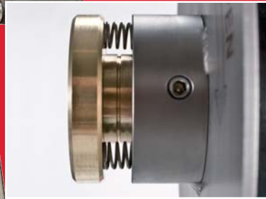
The tension brake disc ensures constant tension when rolling off the strap.