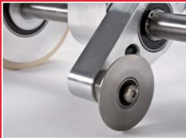
The guide roller holds the TAPEMAT «Spiegel» on course.