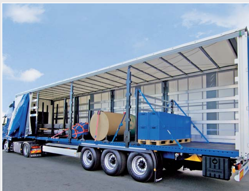
Tarpaulin bows for fixed and sliding rooftops of lorrys.